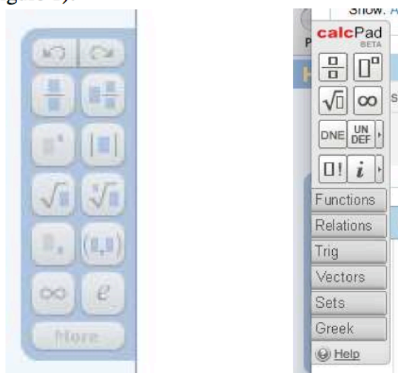
Figure 1. Tool bars for MyMathLab and WebAssign.

Each system has a very limited palette or toolbar of symbols that allows users to submit, fractions, radicals, exponents, matrices, etc. Yet both are quite exacting about how answers are entered. This proved frustrating at times and became the reason why I allowed up to five attempts to submit an answer. The toolbar in WebAssign seemed a little bit more intuitive than the one in MyMathLab, although both provided enough tools so the student could write an appropriate answer (see Figure 1).