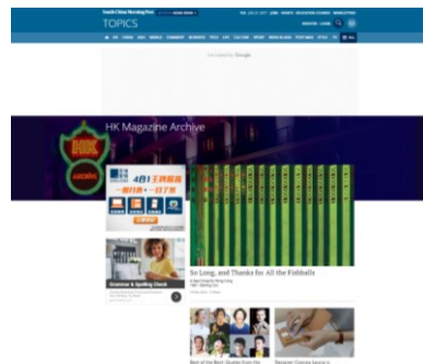
Fig.3 HK Magazine Archive hosted by SCMP Group

Being a highly popular and free English-language magazine, both the media profession and the public responded strongly to the decision to shut down HK Magazine . When the SCMP Group decided to cease publication of HK Magazine , the SCMP spokesperson said “[t]he last issue of HK Magazine will be published on 7 Oct, 2016 while the operations of its website and social media platforms will cease in a few days afterward.” (Anonymous 2016). It is hardly possible to imagine that a media publisher will consider deleting the content of its publication from its website even though the publication has ceased publication. This decision has caused a strong reaction from the Hong Kong Journalists Association to lodge an inquiry with SCMP management. In view of the enormous pressure and negative comments from the community, the SCMP Group finally decided that the online content of HK Magazine would be migrated to the SCMP website before the HK Magazine website was removed. (Grundy, 2016b). (See Fig. 3)