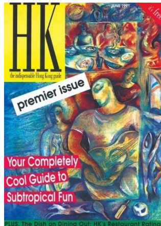
Fig. 1 First Issue in June 1991

The first issue of HK Magazine was published in June 1991 under the title HK: the indispensable Hong Kong Guide by Asia City Publishing Limited which was a private publishing company based in Hong Kong. (See Fig. 1) Apart from HK Magazine , Asia City Publishing Limited also published a portfolio of free lifestyle publications in the city including Where Hong Kong (an international travel magazine), Where Chinese (a magazine for Mainland China tourists), The List (a bi-weekly women's magazine), etc.