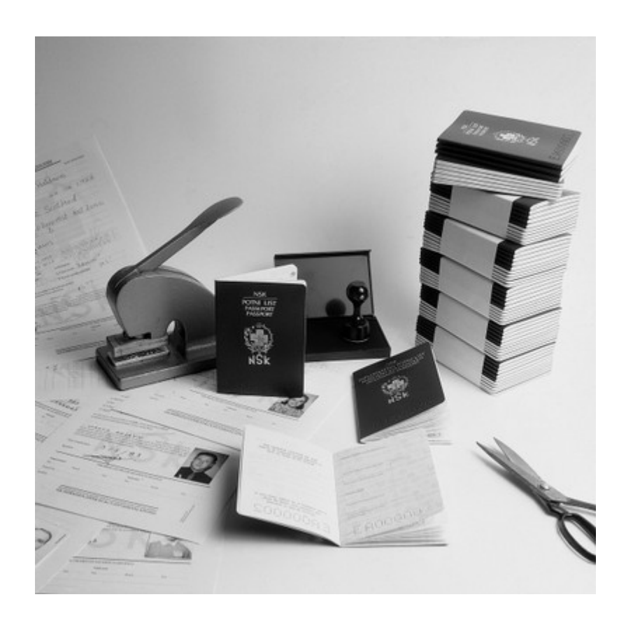
IRWIN, NSK Passport (1993)

The requested participation of observers and users has apparently turned into a self-conscious (friendly) takeover. Which of these processes still remain in the hands of the 'initiators'? And how you deal with this sort of 'disempowerment'?