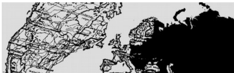
IRWIN, Map of Eastern Modernism, 1990