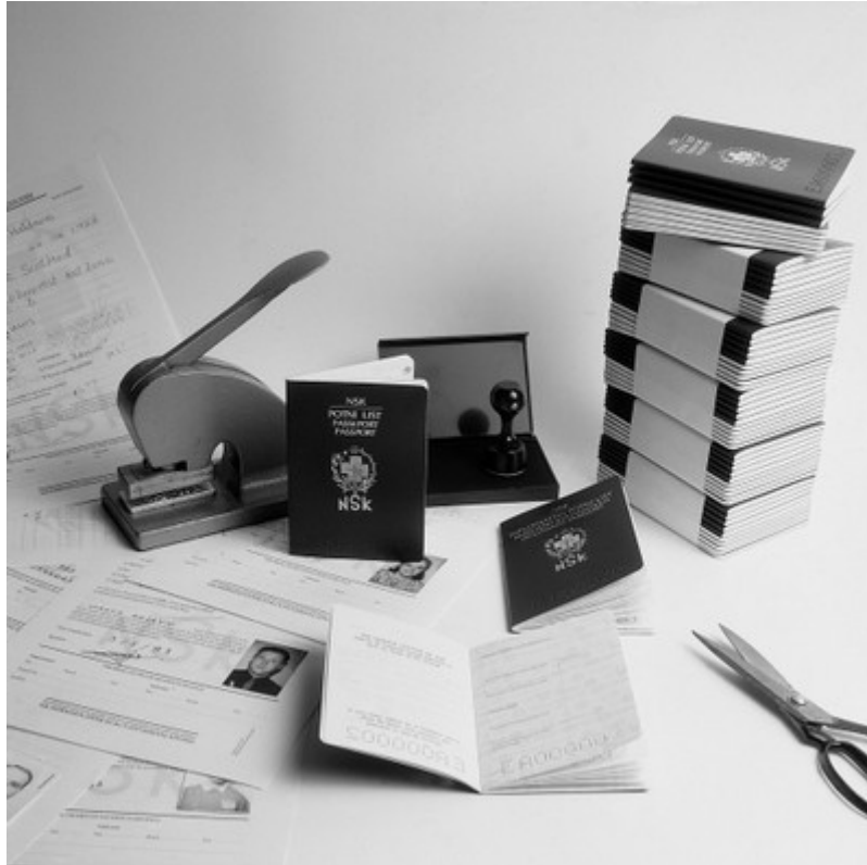
IRWIN, NSK Passport (1993)

The requested participation of observers and users has apparently turned into a self-conscious (friendly) takeover. Which of these processes still remain in the hands of the ‘initiators’? And how you deal with this sort of ‘disempowerment’?